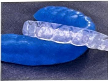
Standard Gumline Trim

Our whitening guards are custom fitted to decrease the risk of whitening gel from coming into contact with your gum tissue. We can “Scallop” your tray at the gumline as an option if you have extra tissue sensitivity or periodontal disease.