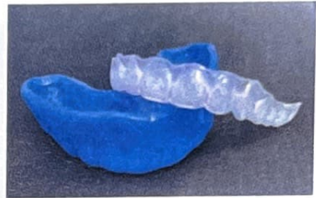
Scalloped Gumline Trim